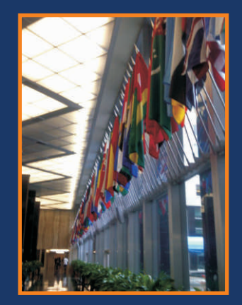
US Department of State